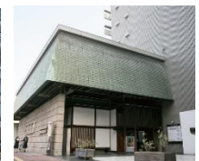
Urushi Lacquer Ware Institute

•If you have a fever(more than 37.5°C)or have a cold symptom, please refrain from participating.