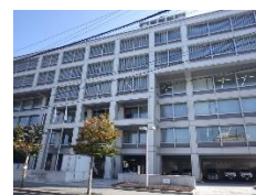
Pref. Police Office